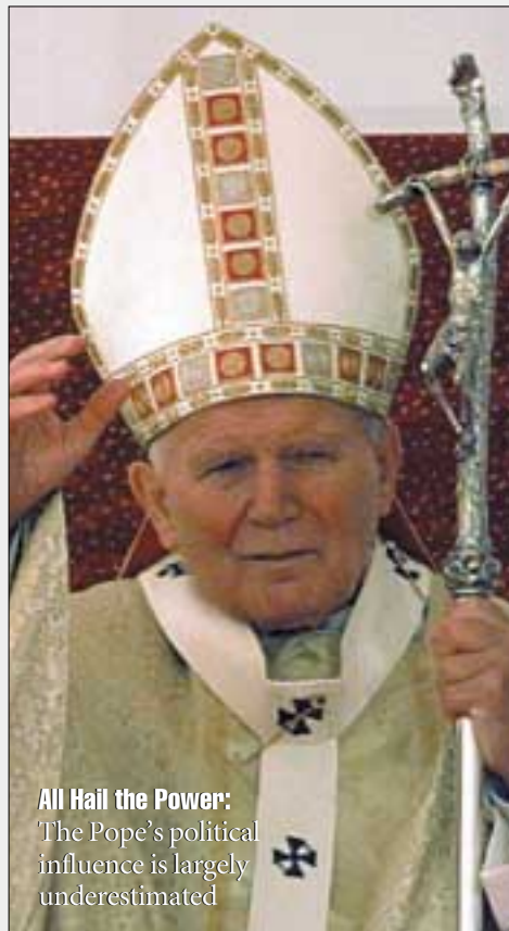
All Hail the Power: The Pope's political influence is largely underestimated

Indeed, when an appropriate catalyst provides the need, no other institution on earth is so well established with a chain of "embassies, emissaries, institutions [churches, real estate,