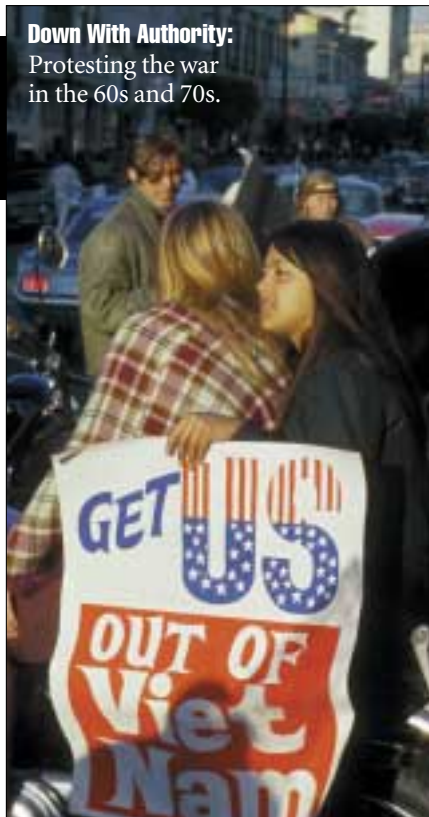
Down With Authority: Protesting the war in the 60s and 70s.

of a child entering adolescence is between 35 and 45 years old, which means they were born in the 50s or early 60s; and that they went to high school roughly between 1967 and 1981. Pretty tumultuous—and influential—years in the history of American youth.