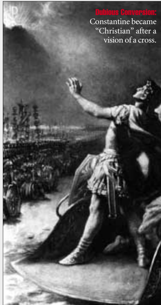
Dubious Conversion: Constantine became "Christian" after a vision of a cross.