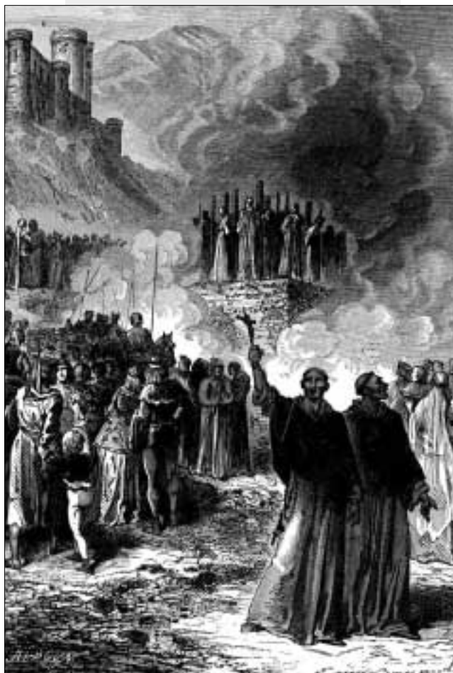
Enforcing the 'Day of Rest': After A.D. 363, millions were martyred for Sabbath-keeping.

The countdown to the year 2,000 ticks away, a year in which the Vatican will lead global celebration of its almost 2000-year history, a year in which Europe’s largest construction site, the city of Berlin, will light up as the reborn capital of a reborn Germany. Stay attuned to the spirit of prophecy behind today’s world news (Rev. 19:10). Grasp the vision of the meaning of the climactic events which will usher in a genuine new age; an age of global peace, harmony and unity under the supreme authority of the one true God, which He will bestow upon the shoulder of His only begotten Son (Isa. 9:6-7). ♦