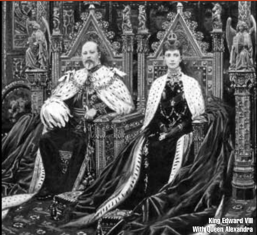
King Edward VIII With Queen Alexandra

Excerpt from the former British coronation oath