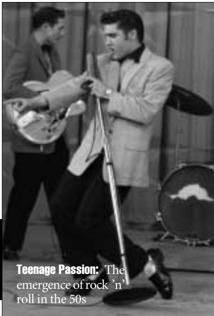
Teenage Passion: The emergence of rock 'n' roll in the 50s

The teen market burgeoned in the wake of America’s post-World-War-II prosperity. Suddenly even working-class teens had the chance to cast their dollar votes. “Once a mixed group of