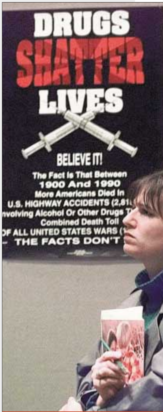
Not Just a Big City Problem: A concerned mother listens at a town meeting in Plano, Texas. In less than two years, 10 youths have died of drug overdoses.

dominance of Colombian heroin on our streets? Historic evidence shows that there very well could be. Heroin is our 90s drug. Its popularity is now very much on the rise. Are we not seeing a repeat of the 60s, 70s and 80s? Will we, as a people, ever learn the lesson of history? It appears we quickly forget even recent history.