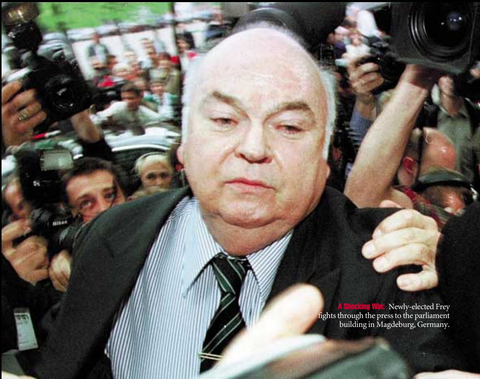
A Shocking Win: Newly-elected Frey fights through the press to the parliament building in Magdeburg, Germany.