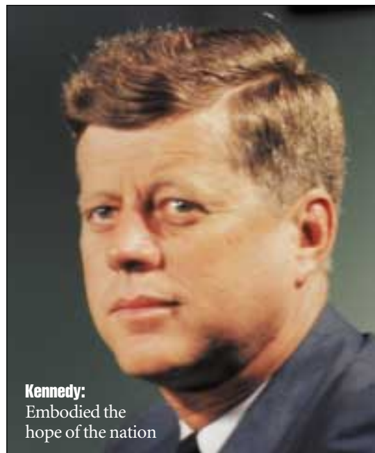
Kennedy: Embodied the hope of the nation