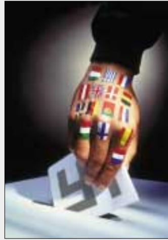
ON THE COVER: Dangerous signs for Europe—Germany's far-right is racking up political successes.