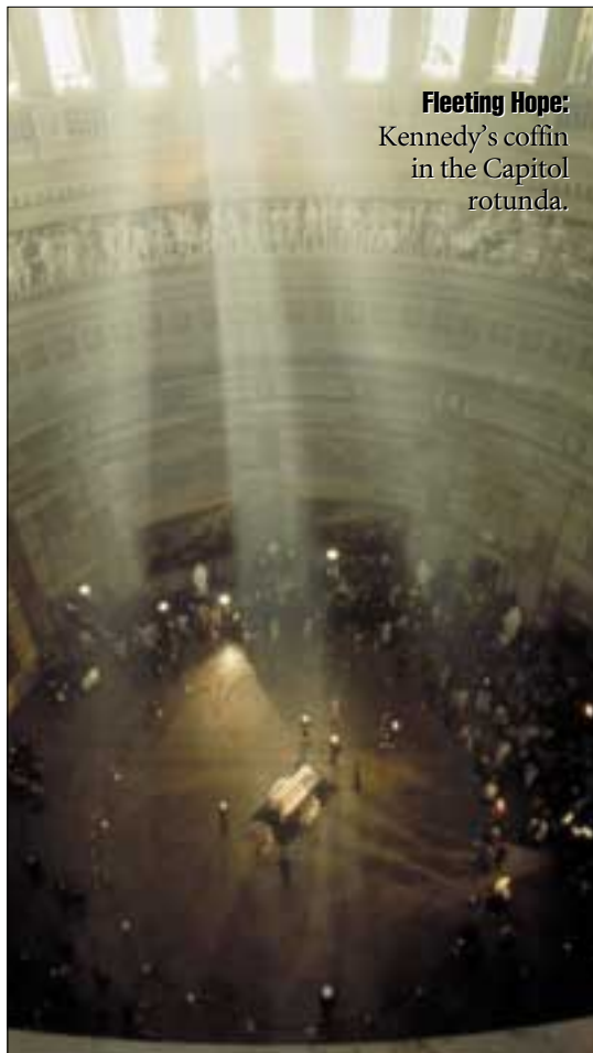
Fleeting Hope: Kennedy's coffin in the Capitol rotunda.

Every man who commits that faithless mistake is destined to have his hopes shattered. America and the world are going through a process of learning the hard way that there is no hope in man. When we finally learn that lesson, we can then turn to the great God where there is super abundant hope! May God speed that day.